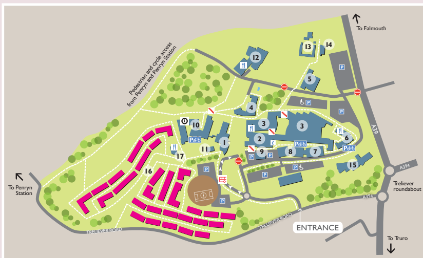
The department locations are correct as of March 2020