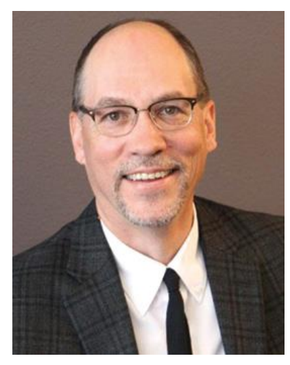
who come after you.

For over ninety years, Centralia College has played a vital role in our community. We take pride in the quality of the education we offer and the memories we help to build for our students. We are happy to welcome you to Centralia College, and we hope that the time you spend here will be an exciting next step on the way to your own life's goals.