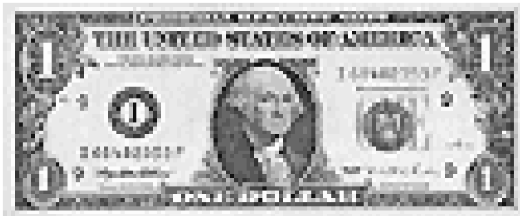
One dollar bill $1.00

The Five, Ten, Twenty dollar bills are also used frequently. These bills are similar to the One dollar bill, however with different pictures and numbers corresponding to their worth.