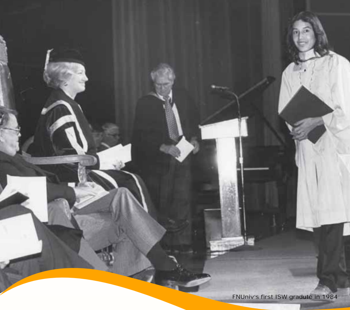
FNUiv's first ISW graduate in 1984