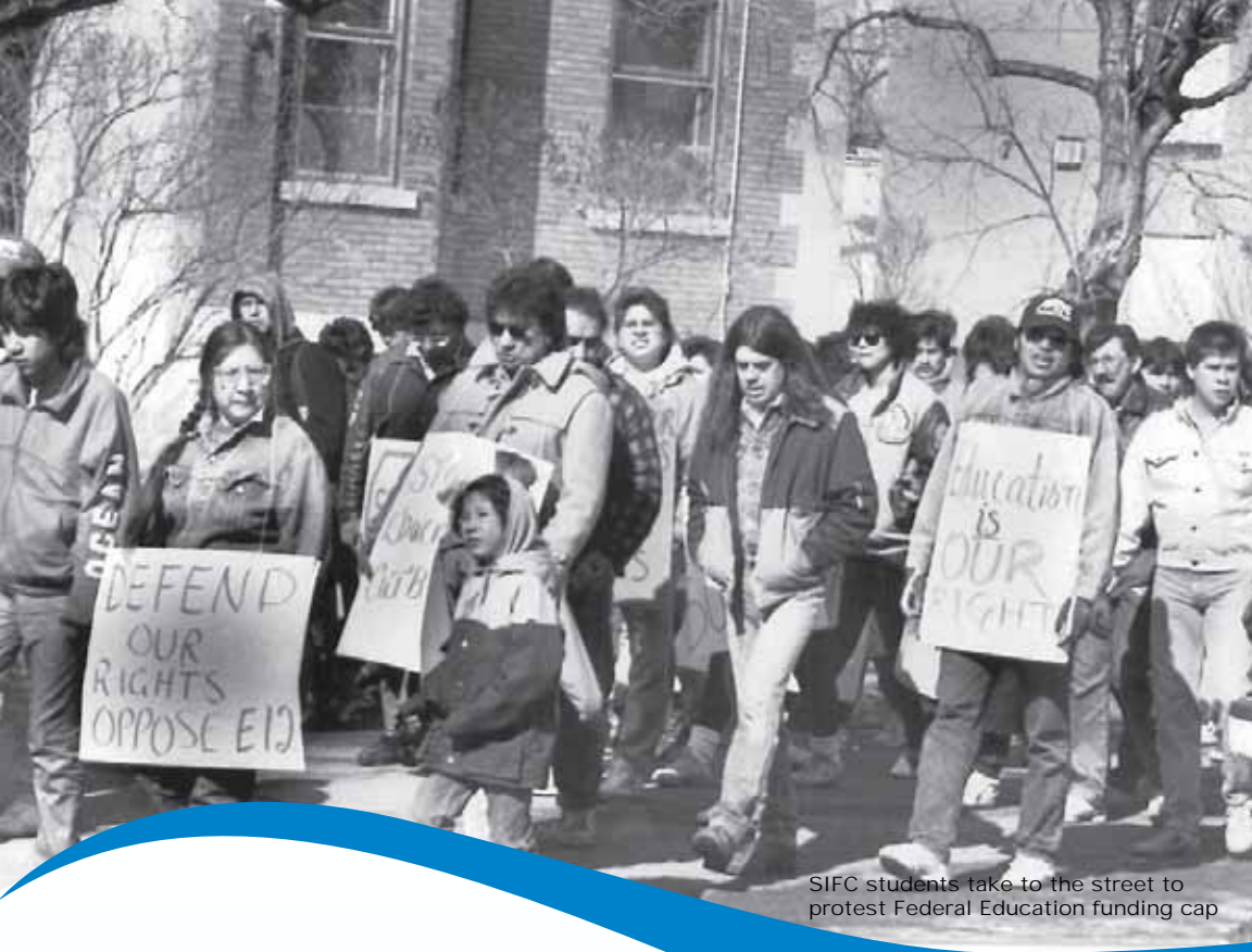
SIFC students take to the street to protest Federal Education funding cap